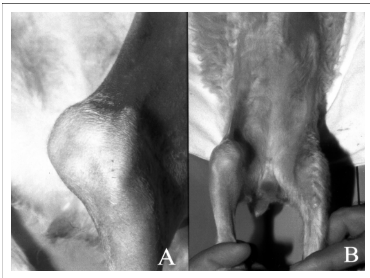
Figure 2 - Photographic images of the animal with bilaterally lateral patellar luxation grade IV. Preoperative evaluation of the left hindlimb. Note the difficulty in the extension of the stifle joint and severe muscular atrophy (A). Two weeks after the correction of lateral patellar luxation in the left hindlimb. Note the difference in extension between the right and left stifle joints (B).

alignment of the thigh extensor mechanism related to the quadriceps musculature (VASSEUR, 1993; MCLAUGHIN, 1996; PIEMATTEI & FLO, 1997). Trochleoplasty was used to promote patellar stability in the femoral trochlea and to permit realignment of the extensor mechanism. This is a simple technique that can be used in dogs younger than six months (VASSEUR, 1993). Due to the fact that adhesion of cartilage to the subchondral bone in older animals prevents cartilage dissection (HULSE, 1995). Although this technique has been used in animals even to nine months, it was not observed larger difficulties, because the cartilage was not still totally adhered to the bone subchondral as referred for HULSE (1995).